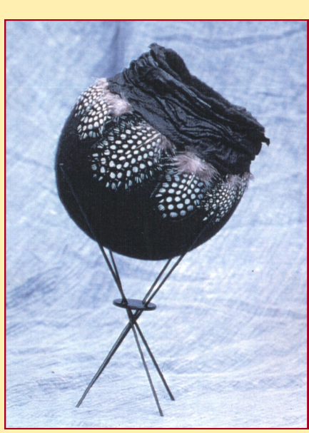
Treasure Nest—Feather Touch