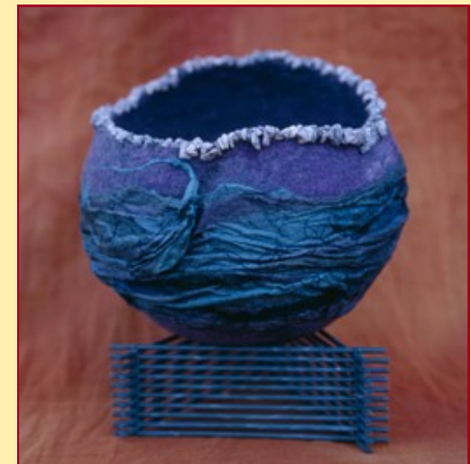
Treasure Nest—Aqua Wave