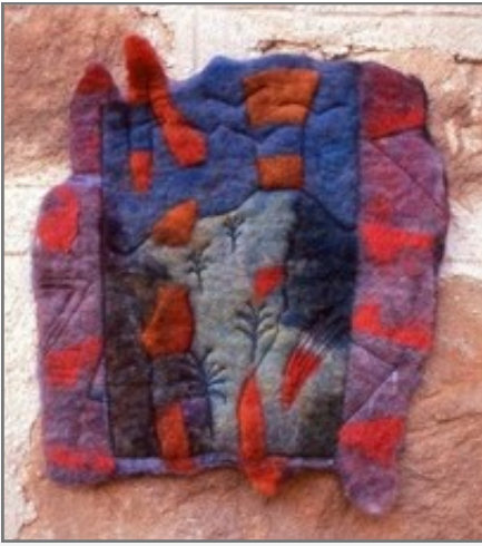
'Home after a long time wandering'